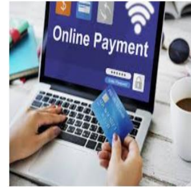
Consumer Pays for the Request