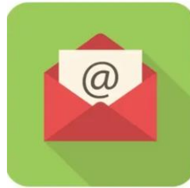
Consumer Views Request